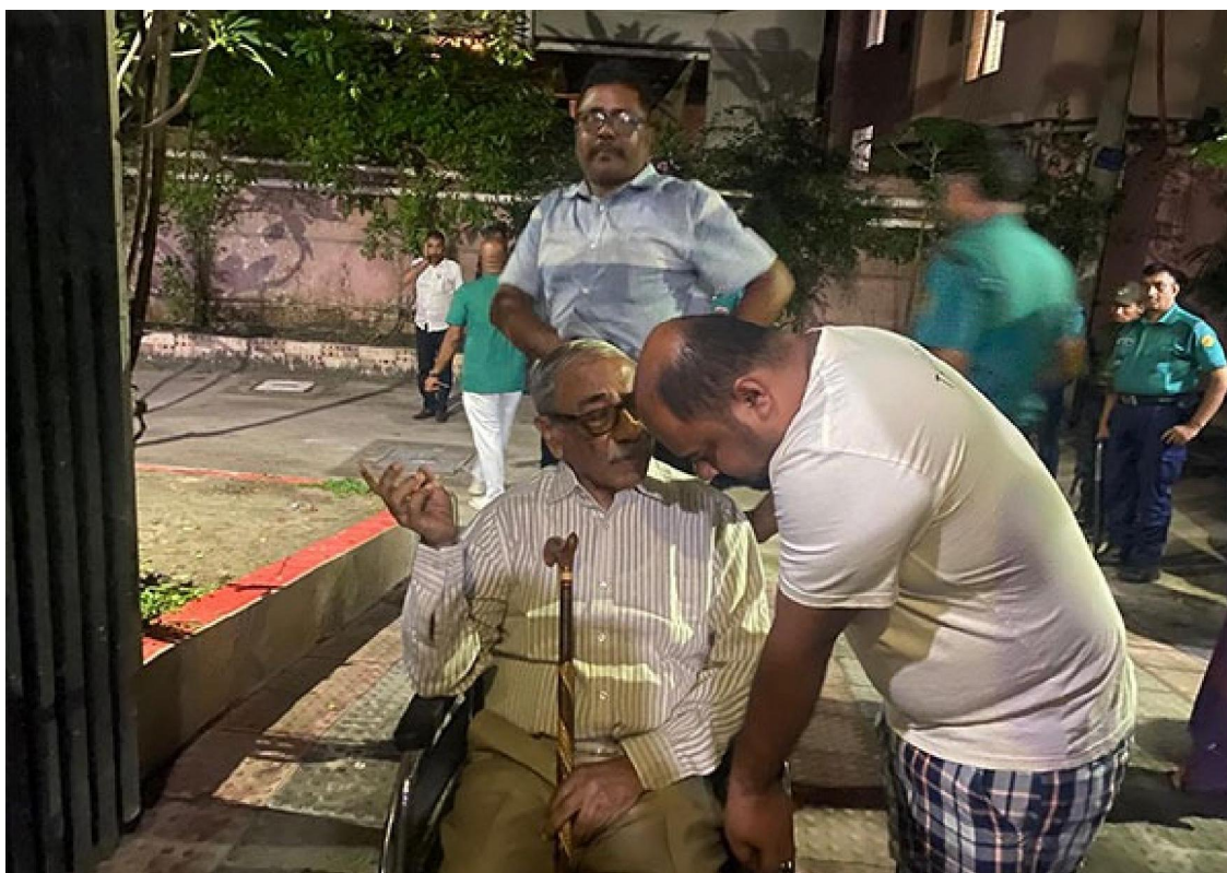
Journalist Shahriar Kabir under detention since 16.09.2024